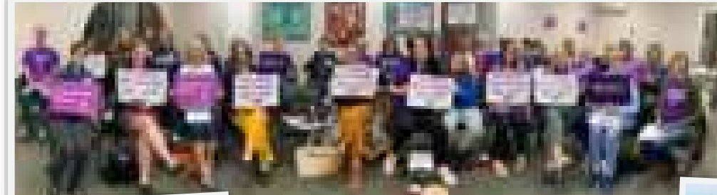
In Washington, DC, our volunteer leaders canvassed in Virginia.

Our strategy is simple: By training volunteers to lead their own local organizing teams, we're creating a committed, ever-expanding network of activists while also building a community of volunteers to work together, trade tips, and organize their communities for reproductive freedom.