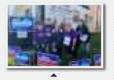
NARAL members canvassed for Beshear.

NARAL recruited over 130 volunteers to help elect Beshear.